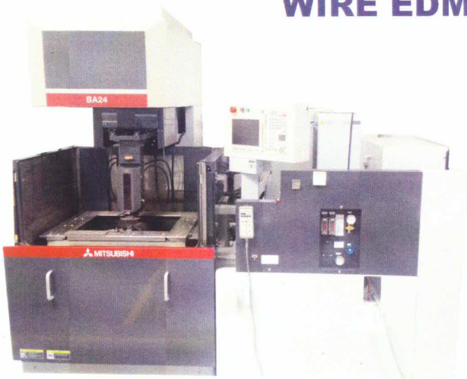
Mitsubishi BA24 Wire EDM