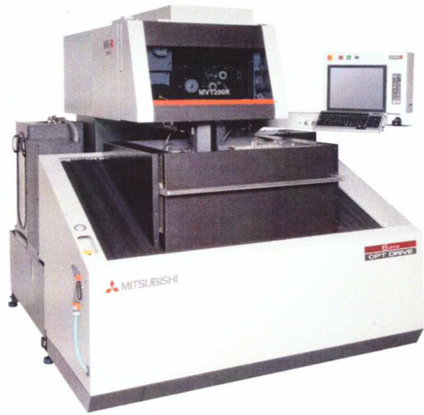
Mitsubishi MV1200R Wire EDM